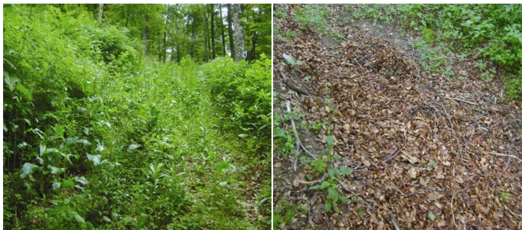
Photo 3. Natural appearance of grass vegetation and litter in function of prevention of erosion processes on tractor roads

sunlight which precipitates grass growth. Besides mentioned, impact can also be made by somewhat better grass coverage in close vicinity to skid roads, and most likely grass seed by the power of wind found its way to skid roads, while smaller coverage of skid roads on Location I, could be explained by more intense erosion processes which disabled natural regeneration (impact of water flow per skid). Natural coverage and holding up of litter have important role in prevention of intensification of erosion processes on tractor roads (Photo 3).