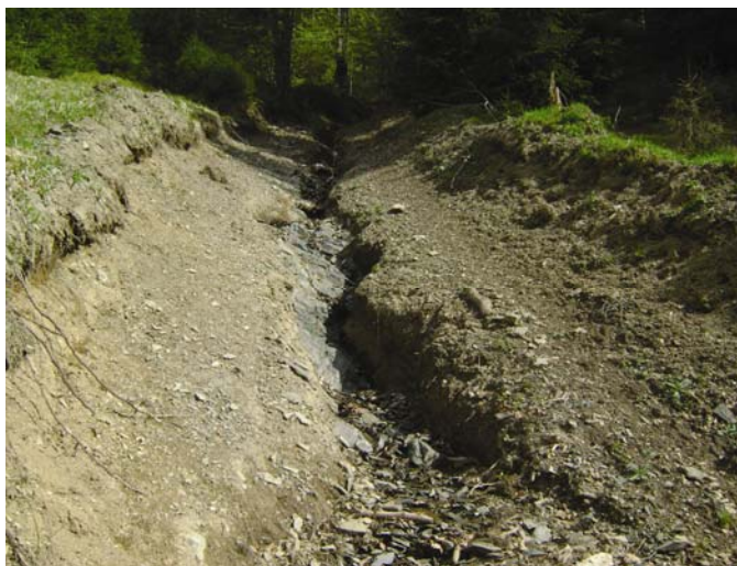
Photo 2. Impact of surface water on intensification of erosion processes

Negative action of surface water on tractor road is clearly presented on photo 2.